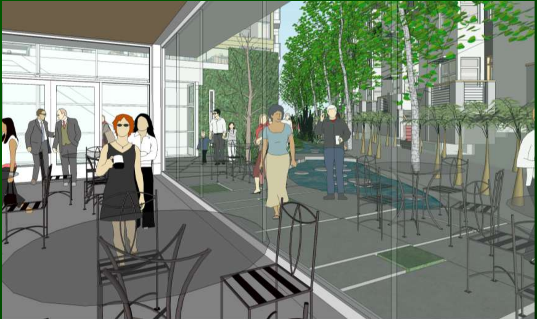
Proposed greenway and plaza viewed from commercial space