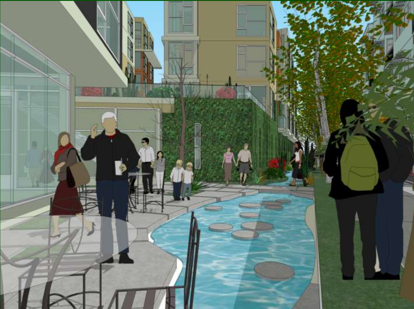
New greenway plaza and creek terminus