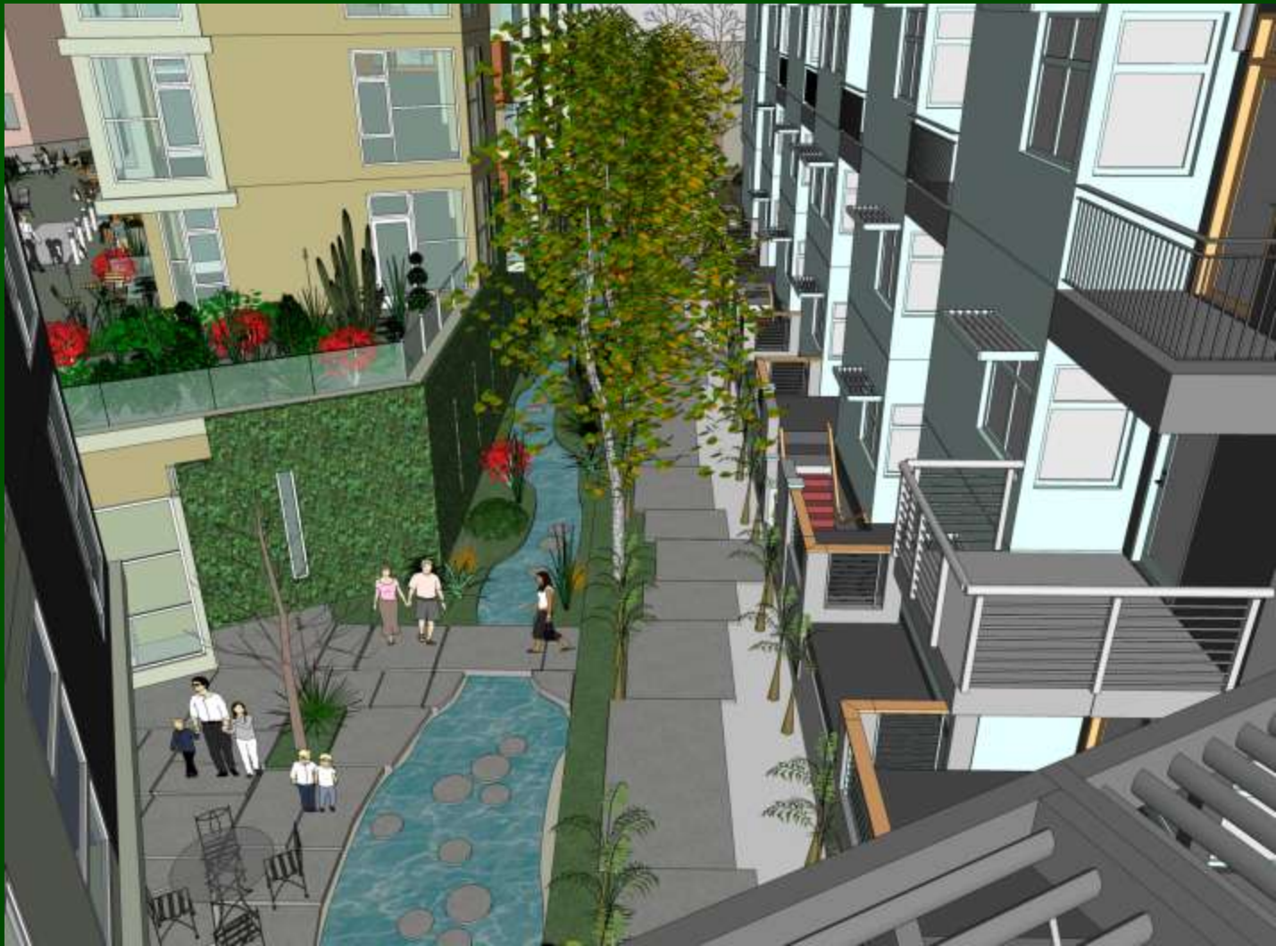
Greenway plaza looking North