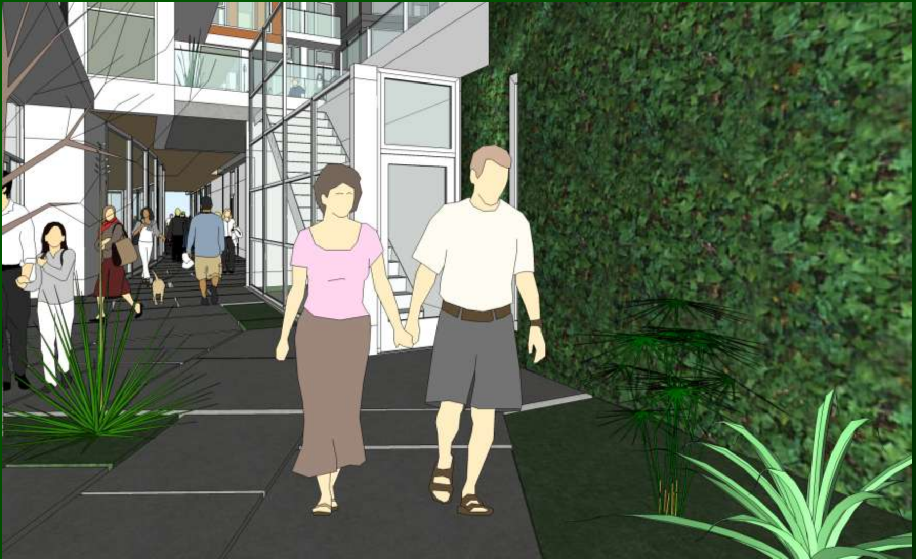
Project provides lively arcade between greenway plaza and Telegraph Avenue