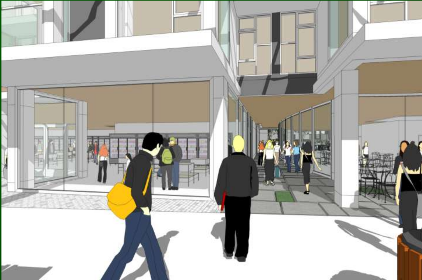
View of arcade from Telegraph Avenue looking East towards greenway plaza