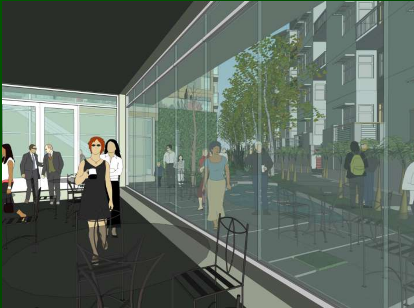
View of greenway and plaza from commercial space