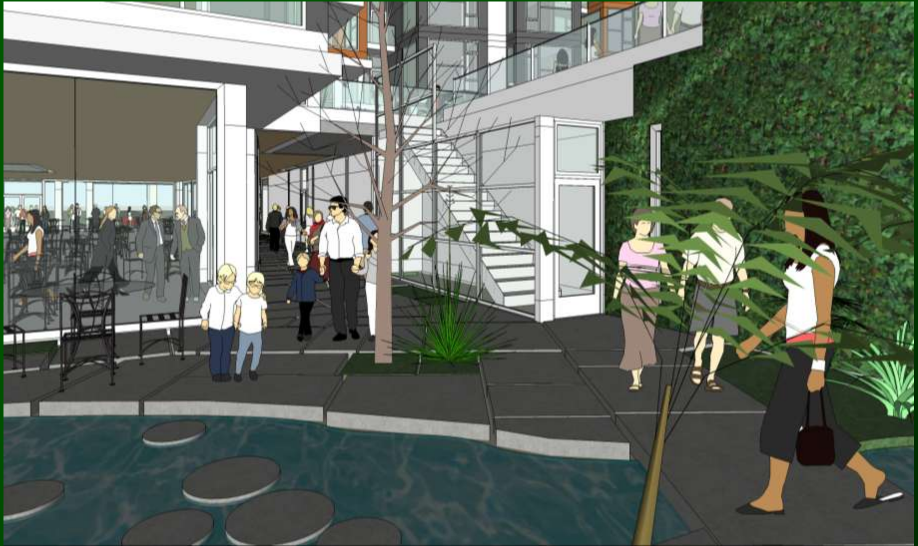
View of greenway plaza looking West